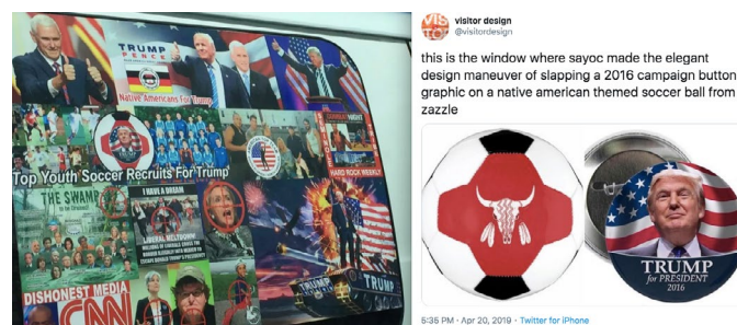
2 – Detail of Sayoc van window (via sun-sentinel.com) with graphic source identified in a tweet by visitor design. Courtesy of @visitordesign, 20 April 2019

Since spring of 2019, the multimedia maker known professionally as visitor design has been painstakingly re-creating each of the vehicle's eight illustrated windows (ill. 3). His project is essentially a montage in reverse: working backwards from press photos of the van, he has deciphered its individual stickers and identified their source imagery. 4 To make some of the original decals, Sayoc had repurposed and edited existing memes from sites like 4chan. For other custom designs, he overlaid found images with idiosyncratic text (ill. 4) 5 – layouts which visitor reassembled in Adobe Illustrator. 6 "I used a combination of image scraping tools, a neural net, and long hours of detective work in Yandex's reverse image search," he explained in an email. With the help of this image recognition software, visitor located files for all but two of the photos adhered to the van. One of these – a scanned family photo – he described recreating from an image of a van window "at a high enough resolution to extract and upsample that sticker, clone out the text, undistort the image, and reapply the text as vectors." 7 He sourced other images from Sayoc's social media accounts before they were disabled by the FBI. By combing through the internet's vast database of visual detritus, visitor was able to re-create Sayoc's decals in exacting detail. 8,9 Attending to the layout of the images and their