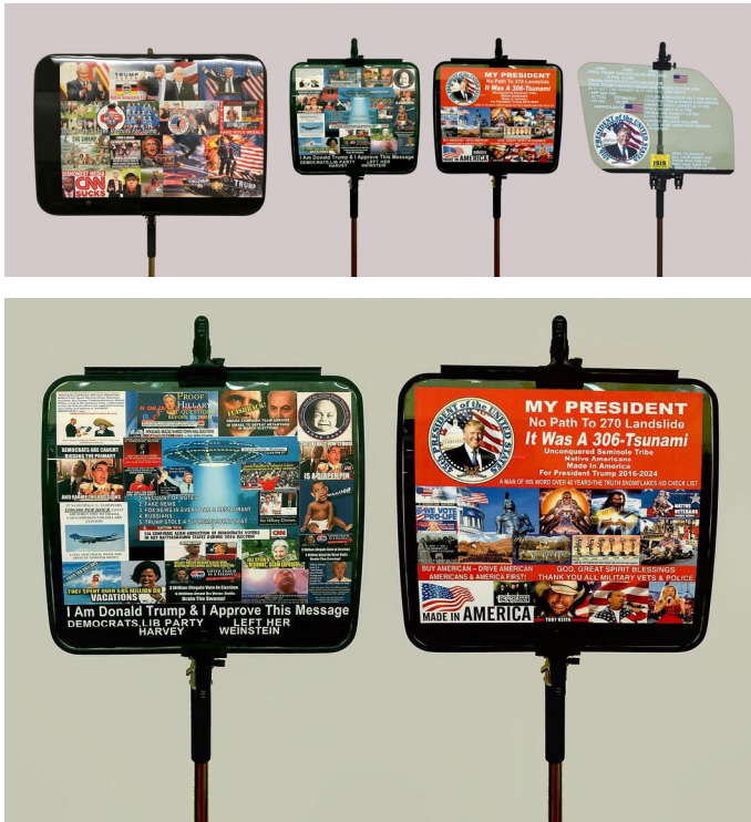
3 – visitor design, untitled side passenger doors, 2019. Laminated decals on tinted glass. Courtesy of via @visitordesign

infinitesimal evolution over time, he engages a new archival mode of montage, particularly suited to digital experience.