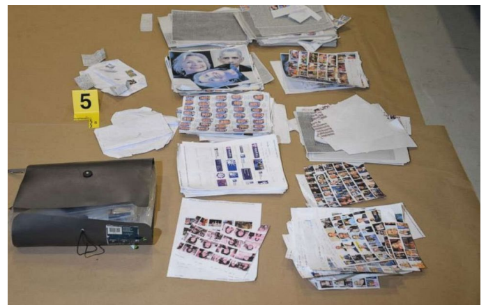
5 – Photographic materials found in Sayoc's van.